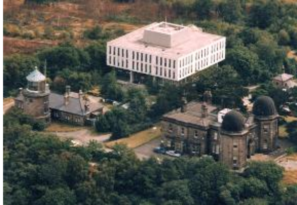
Overview of the observatory buildings (left to right – the Lighthouse and Keeper's cottages, the Proudman Building and the Observatory.)

The current owners, NERC (Natural Environment Research Council) moved out of the Buildings in December 2004 and are currently looking at selling the site, so the future of these wonderful buildings is still undecided but we can only hope they are returned to the people for the future of Bidston Hill.